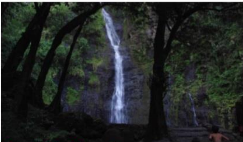
The waterfall of Faarumai