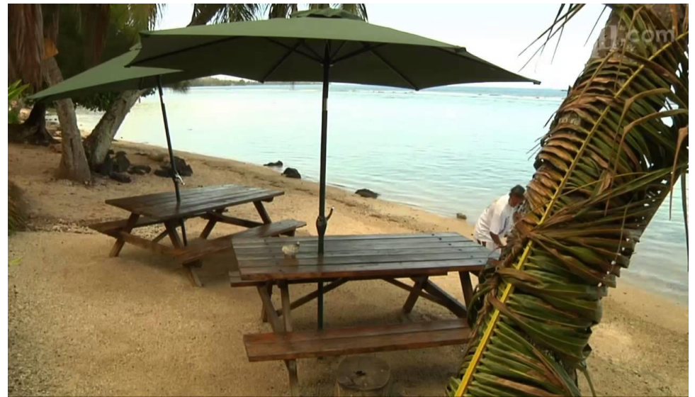
The beach of vairao