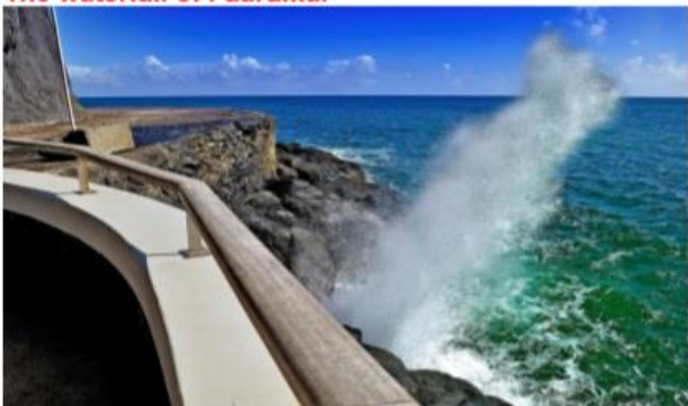
The blow hole