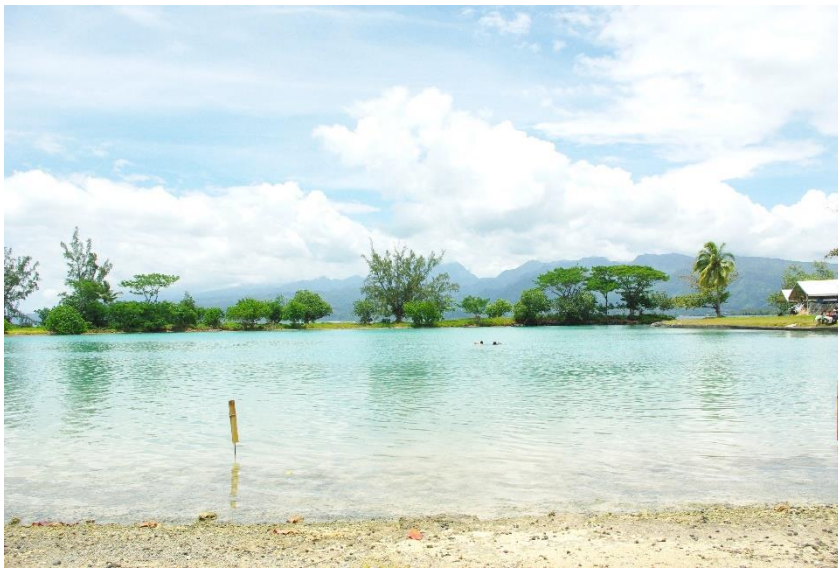
The beach of vairao