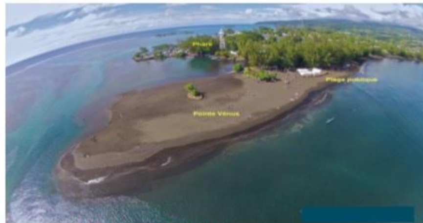
The venus Point and the light house