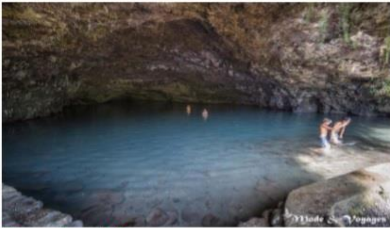
The grottos of Maraa