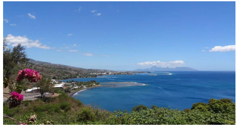
Taharaa belvedere look out