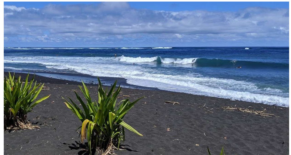
Taharuu surf beach