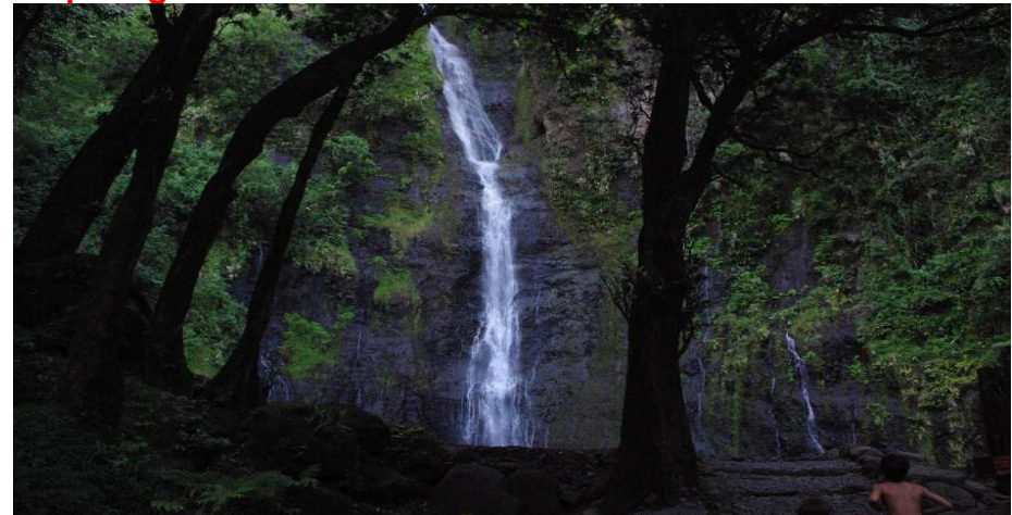
The waterfall of Faarumai