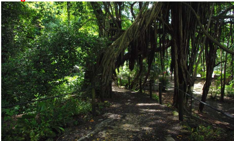
The grottos of Maraa