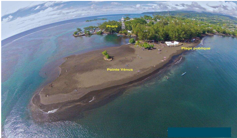
The point Vénus and the light house