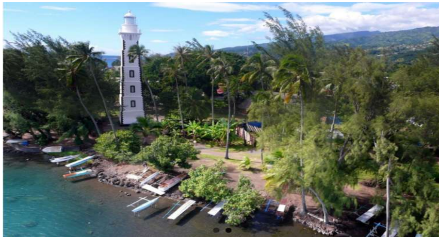
The light house of point vénus